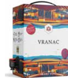
Vranac 12,5% vol. • 3 L.