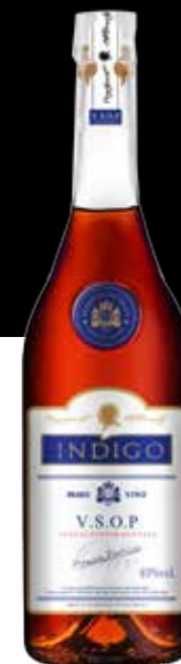
INDIGO VSOP 40% vol. • 0,7 L.