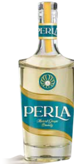
Perla - Muscat