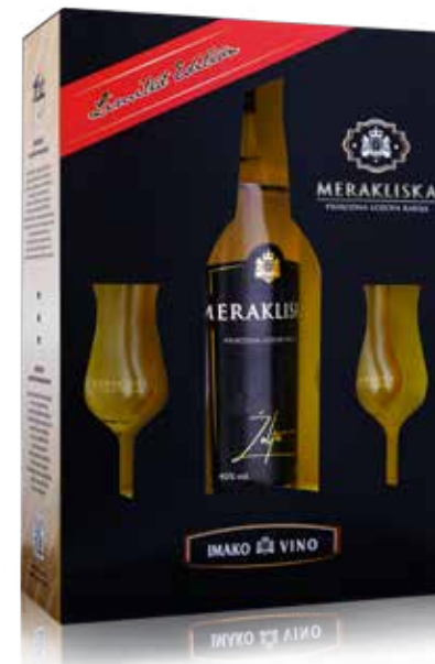
Set Meraklsika + 2 authentic glasses