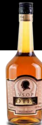
OTEC VSOP 45% vol. • 0,7 L.