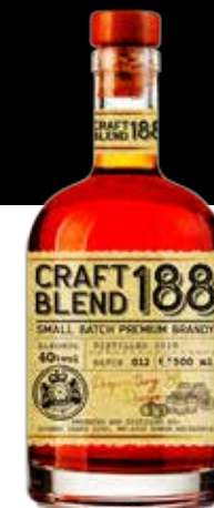
Small Batch Craft Blend 188 40% vol. • 0,5 L.