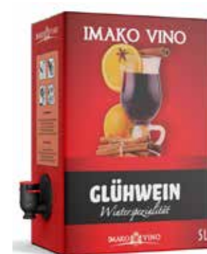
Mulled wine 10,5% vol. • 5L