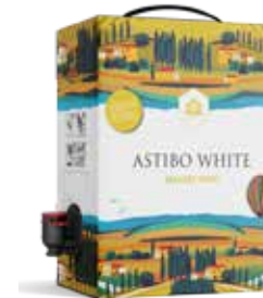
Astibo White 11,5% vol. • 3 L & 5L.