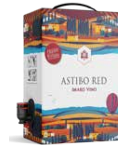
Astibo Red 11,5% vol. • 3 L. & 5L