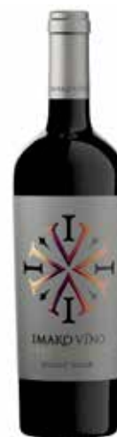
Estate Pinot Noir