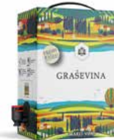
Grasevina 11,5% vol. • 3 L.