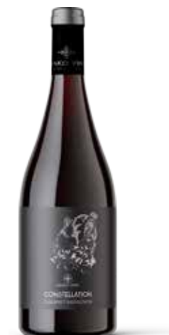
Constellation Cabernet Sauvignon