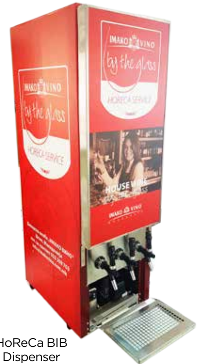
HoReCa BIB Dispenser

Popular for hotels and restaurants and a practical and environmental savvy option for many wine consumers to enjoy at home.