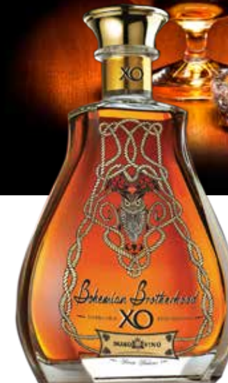
Bohemian Brotherhood XO 40% vol. • 0,7 L.