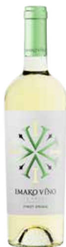
Estate Pinot Grigio